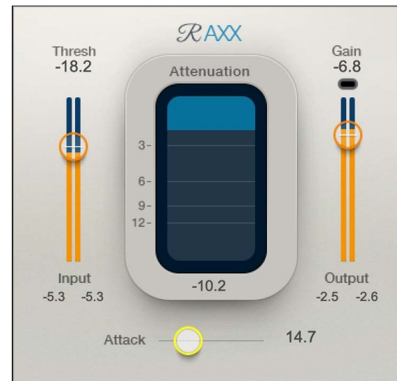
Renaissance Axx stereo