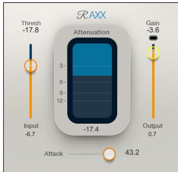
Renaissance Axx mono

There are two Renaissance Axx Components: mono and stereo. They are identical except for the number of input and output channels.